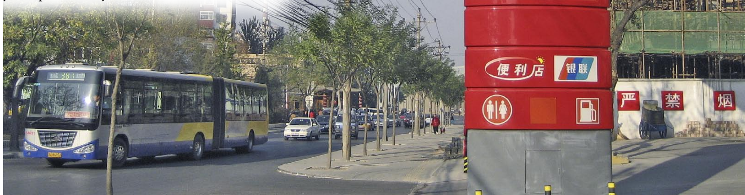
Price board in front of a filling station in Beijing

In order to broaden the database and to provide data series throughout the year we decided to invite the public to participate in our study. Please assist us by completing the form on our special webpage: http://www.sutp.org/fuelprices .